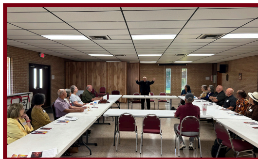
New Iberia / Franklin Area