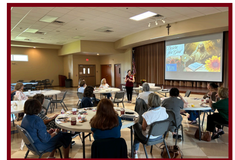
Morgan City Area