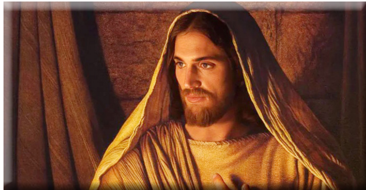
The Commemoration of all the Faithful Departed

Spiritual Insights Reports Formation Program Updates