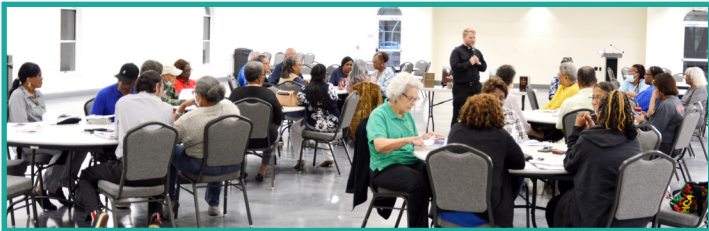
Leader Training Our Lady Help of Christians - Jennings, LA