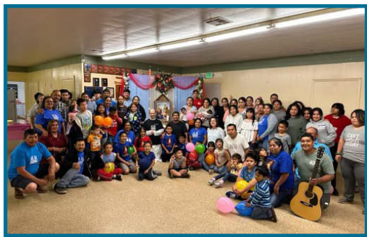
Celebrating two years of ¡Ven Señor Jesús! Congratulations, Sacred Heart Catholic Church Church Point, LA

When I needed to attend Come, Lord Jesus! at a different time and day, I was invited to join another group. Leaving my first group was difficult. I immediately felt welcomed by my new group. I mention this because I know that groups sometimes grow so large that they have to divide and form new groups. People may feel reluctant because of the close bonds of friendship and trust. But starting out with a new group is like starting out on a new adventure. I believe that I have only just begun this journey to learn about Jesus and his church. I know that I do not face the future alone. I have my fellow Come, Lord Jesus! members to travel this path with me.